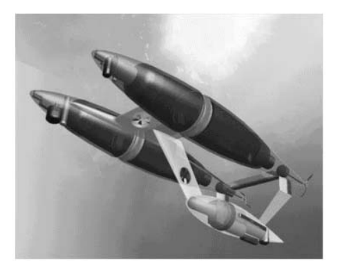
Fig. 3. DeepC Vehicle

intervention tasks (offshore application for instance). Mechanically, the vehicle structure consists of a basis tubular structure on which the different actuators are arranged, without pre-defined locations, as depicted in figure 2. Central to this structure is the main electronics package containing the vehicle electronics as well as the different set of sensors : attitude, depthmeter, gyrometers, video camera, sonar and sounders.