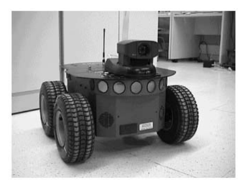
Fig. 4. UAH platform: BART (Basic Agent for Robotic Tasks) robot.

multi-sensor data fusion, image evaluation and higher-level decision techniques. The aim of the active and reactive process is to achieve high levels of reliability and safety for longer underwater missions in different sea areas and in the presence of different ground topologies. The processes involved include: