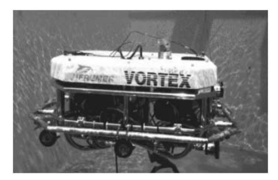
Fig. 2. VORTEX vehicle